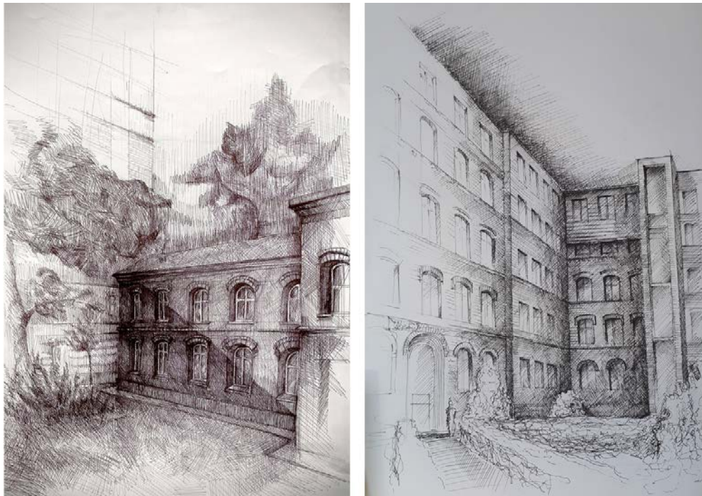
Figure 1: CUT, main campus at Warszawska Street. Student works from 2019/2020: Agata Stasiowska (left) and Aleksandra Bator (right).